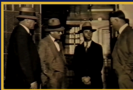
Earl Warren (right) with newly sworn inspectors mid-1920's.

assist deputy district attorneys by conducting thorough investigations in both criminal and civil matters, developing cases, and ensuring that facts are fully and fairly examined. Over time, the division has become a vital part of the office's mission, reflecting Warren's enduring conviction that ethical, professional investigative work is crucial to serving the people of Alameda County.