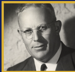
Earl Warren was appointed Alameda County District Attorney in 1925.